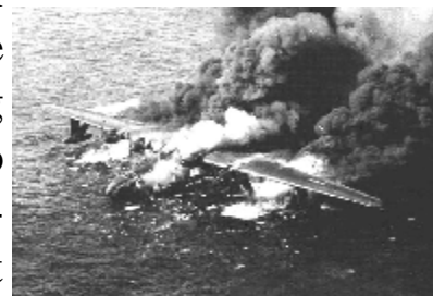
Marshall Mars on fire

Named the Marianas Mars, Philippine Mars, Marshall Mars, Caroline Mars, and a second Hawaii Mars, the 5 production Mars aircraft entered service ferrying cargo to Hawaii and the Pacific Islands. The last production airplane (the Caroline Mars) was designated JRM-2, powered by 3,000 HP Pratt & Whitney R-4360 engines, and featured a higher maximum weight and other improvements. On April 5, 1950, the Marshall Mars was lost near Hawaii when an engine fire consumed the airplane after her crew had evacuated. The remaining "Big Four" flew record amounts of Naval cargo on the San Francisco-Honolulu route effectively until 1956 when they were parked at NAS Alameda.